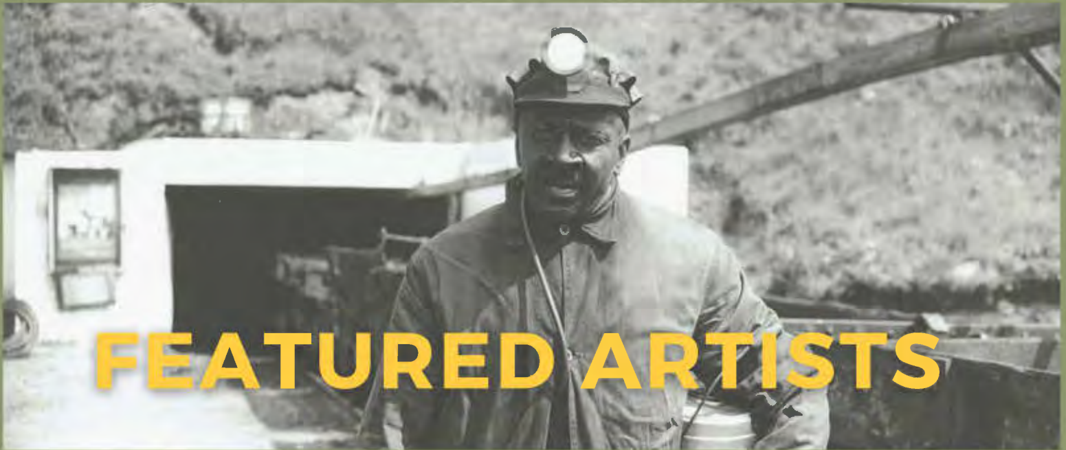
A coal miner, Library, Pennsylvania, ca. 1947.